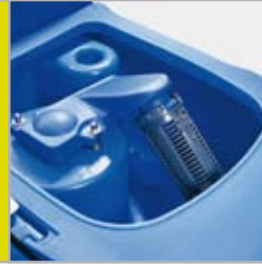
Easy access to clean the recovery tank

This new SCRUBTEC range of walk-behind scrubber dryers represents a modern, practical approach to effective floor cleaning. Through its policy of maintaining an ongoing dialogue with its customers, Nilfisk-ALTO designs machines with features that users actually want and need. Nothing more, nothing less.