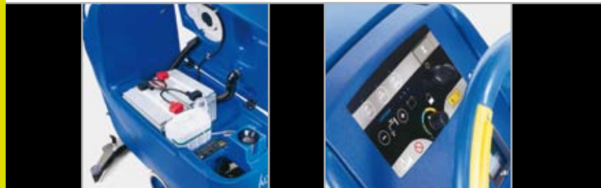
Optional chemical mixing system